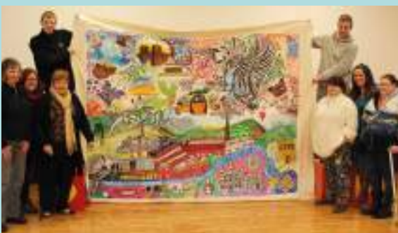
Crafts group

The Arts and Communities programme has enabled the four localities to establish new, or strengthen existing, arts infrastructure. In Bradford the programme has supported the creation of Community Arts Networks in five neighbourhoods, and the council's cultural services team is continuing to support these networks to develop the skills and confidence to deliver new arts activities and events.