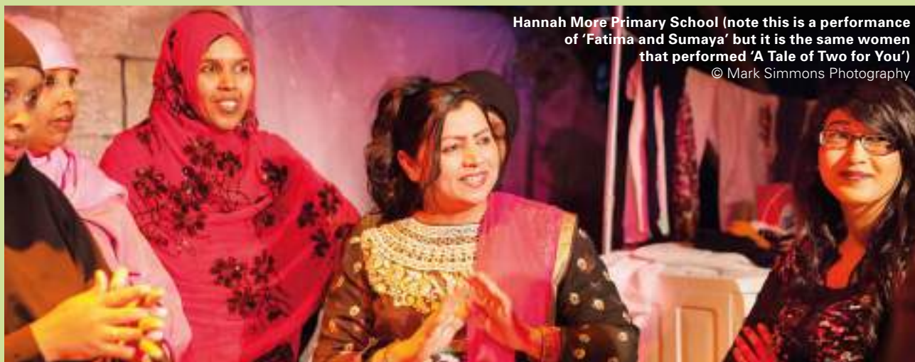
Hannah More Primary School (note this is a performance of 'Fatima and Sumaya' but it is the same women that performed 'A Tale of Two for You')

Engaging adults from migrant communities in drama and theatre by offering drama workshops as a tool to improve communication skills was a successful strategy throughout the Arts and Communities programme, with many participants choosing to continue their engagement and involvement in future productions and getting involved in other community activities and events.