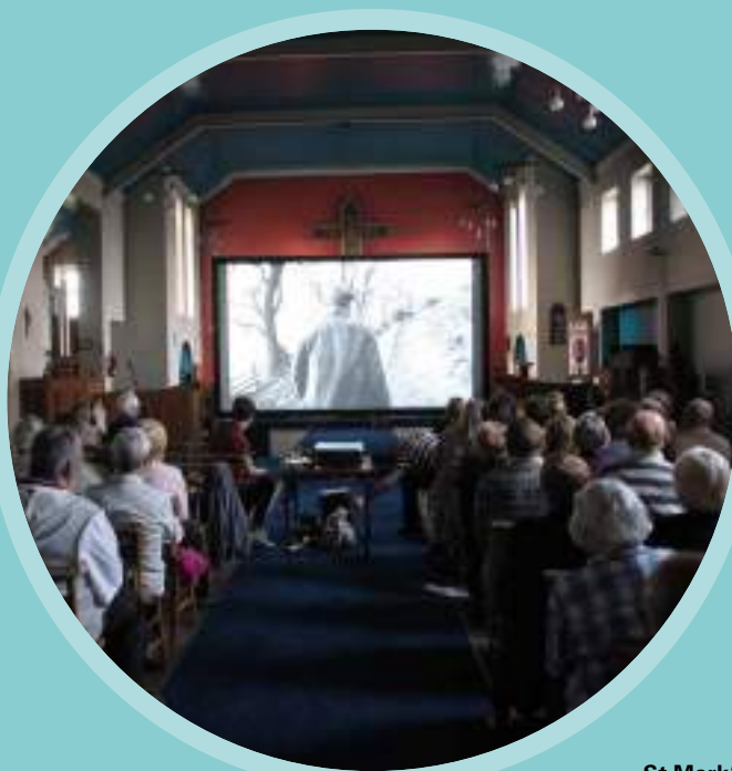
St Mark's Community Cinema

Following the Arts and Communities programme the cinema group has been successful in securing funding from East Lancashire Clinical Commissioning Group and BFI to deliver a further programme of screenings, ensuring that St Mark's church continues to provide a venue for the local community to come together and enjoy a range of films.