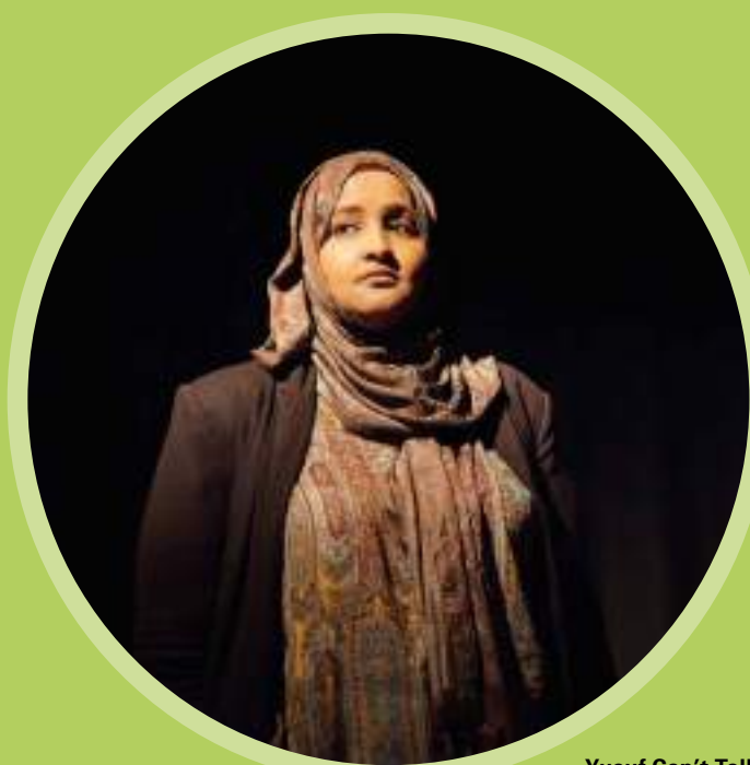
Yusuf Can't Talk

The organisation has also been featured by the BBC World Service. Yusuf Can't Talk has demonstrated the potential of using community theatre to reach out to previously isolated communities and has helped to address the issue of stigma within the Somali community of mothers caring for children with learning difficulties.