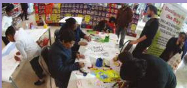
Designs in the Sky © R.M. Sánchez-Camus

The project highlighted the role of 'community gatekeepers' in supporting engagement with communities, with a priest undertaking missionary work in the local Tesco supermarket. It provided a link across people of different faiths, nationalities, languages and ethnicities from a position of trust and familiarity with the local community.