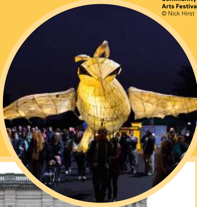
Making a Song and Dance About