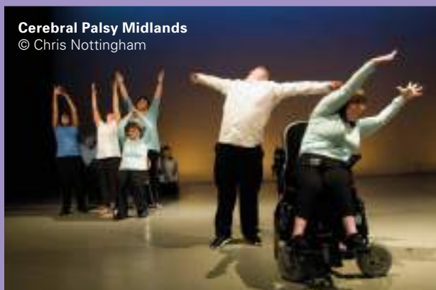
Cerebral Palsy Midlands

Although it is too soon to say what the impact of bringing people together to share arts and cultural activities will be in even the short term, it is clear that CCC has brought together different groups of people who may not have come together in any other way, and has delivered arts and cultural activity that has been inter-generational and ethnically diverse.